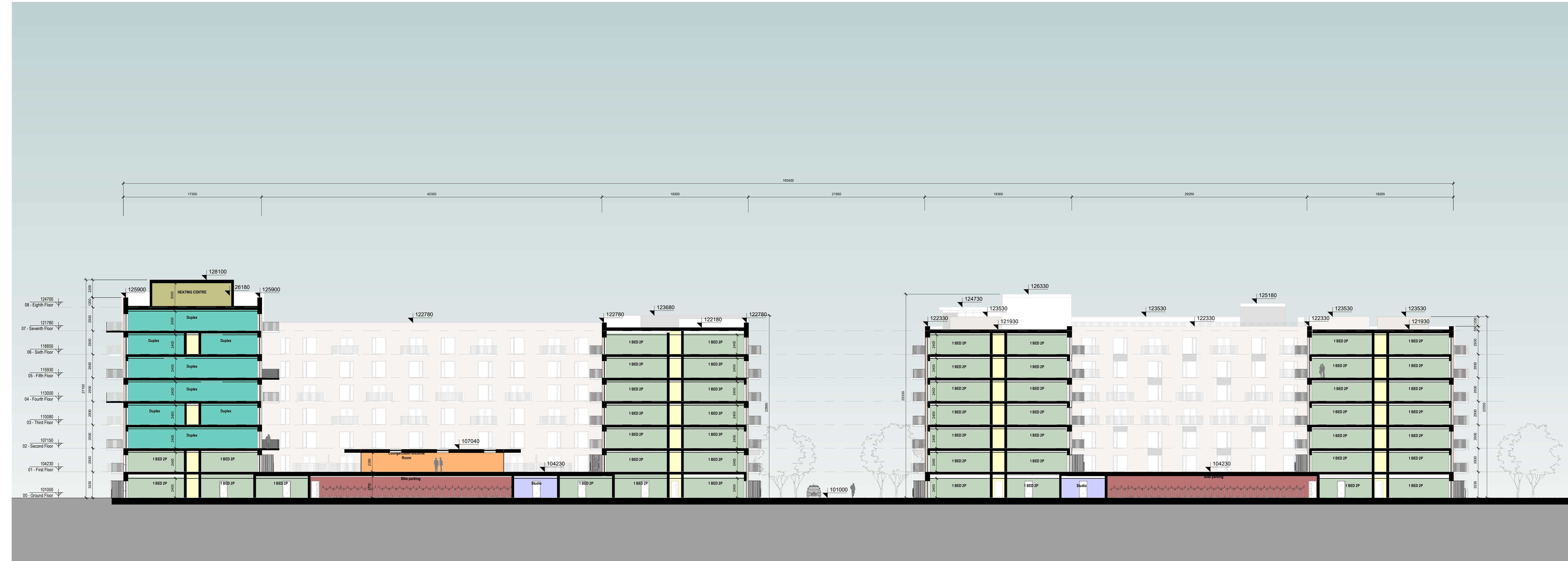
B4 Block B - Section B4 1 : 200